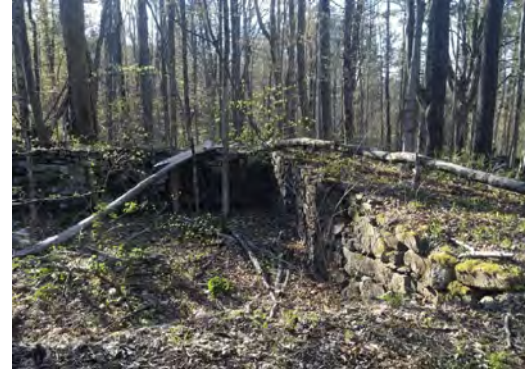
Cellar hole of the Bates residence, which became the poor farm residence.

I came across an item in the description of Maynard Cemetery that piqued my interest: “The cemetery is off of Cricket Hill Road on the north side of a nameless abandoned road that is lined on both sides with stone walls; it is directly across the old road from a large, deep cellar hole that the 1871 F.W. Beers Atlas of Franklin