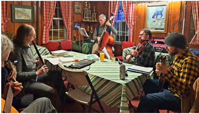
Third Thursday group in a recent session.

cat on the porch for Halloween, a huge snowman at Christmastime, and seasonal decorations for just about every other holiday inside. Her Christmas tree on the porch serves successively Valentine's Day, Saint Paddy's and miscellaneous other holidays up through Cinco de Mayo, always appropriately decorated.