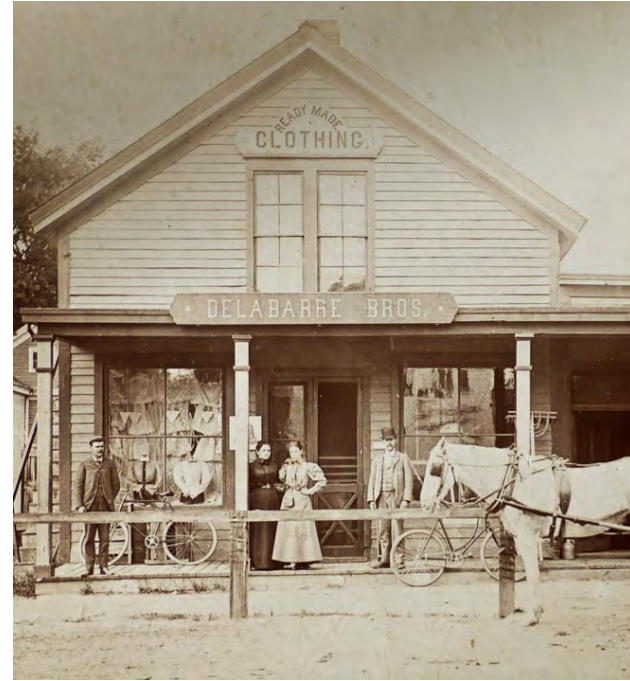
Delabarre Bros. Store c. 1892, housed Conway's post office from 1856 until 1896. It now houses the Conway Historical Society Museum.