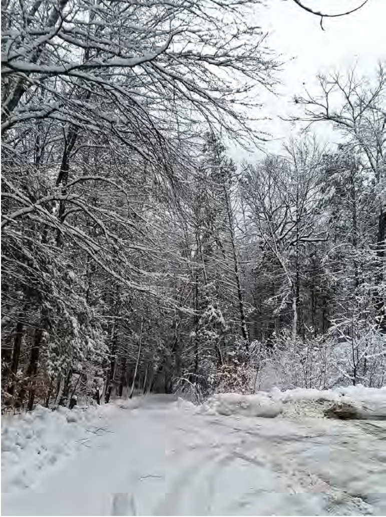
Off Route 116 - The Day After Monday's Storm; January 24, 2023; Staff Photo.

Town of Conway P. O. Box 240 Conway, MA 01341