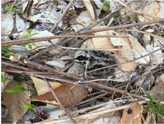
A baby timberdoodle in a young forest at Old Town Farm.

Please come to our next Zoom meeting in June. Keep your eyes on the town's web page, and we will send another postcard. It is a privilege to get to know your town forests and to hear your vision for this resilient ecosystem.